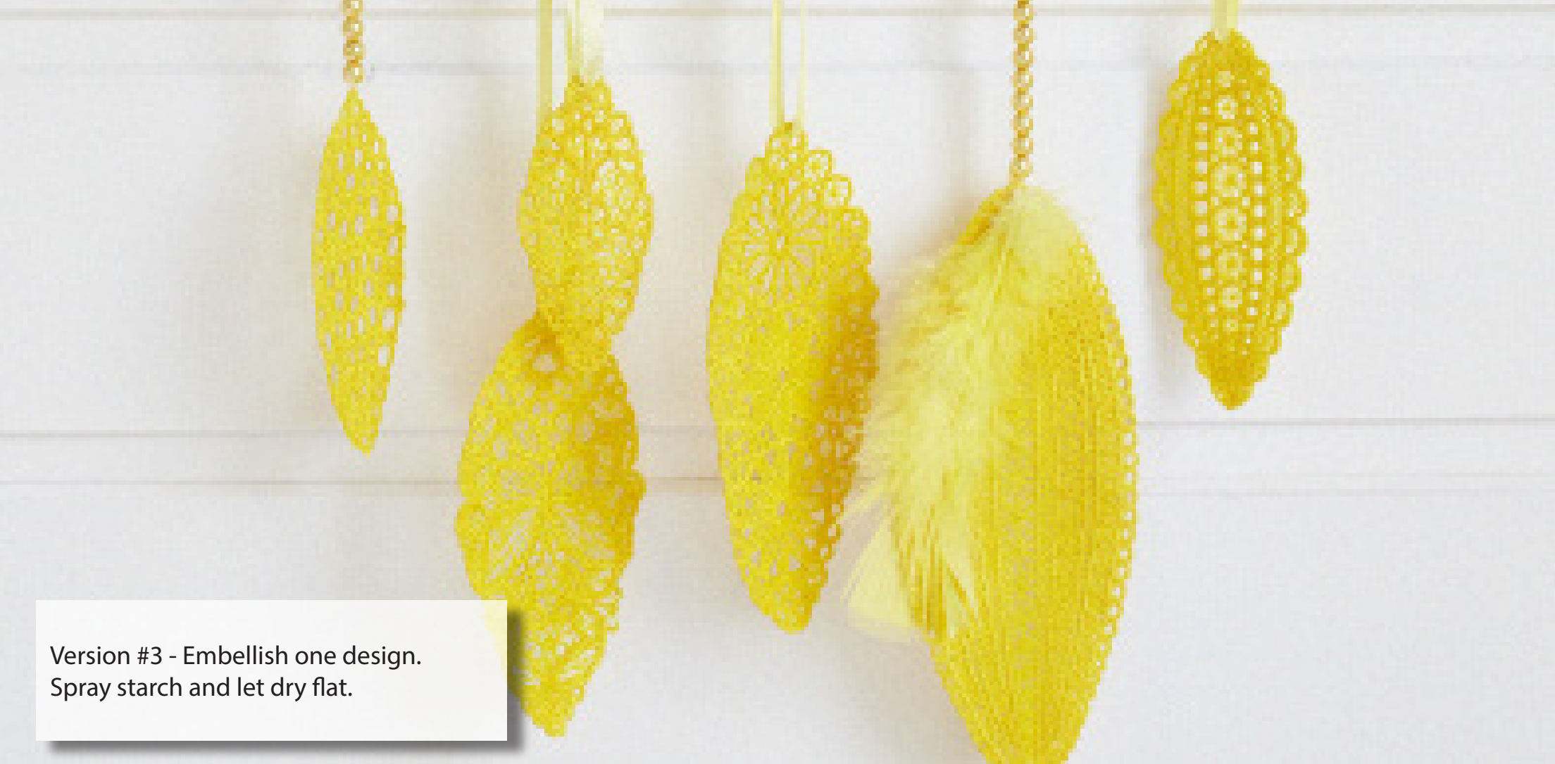
Version #3 - Embellish one design. Spray starch and let dry flat.