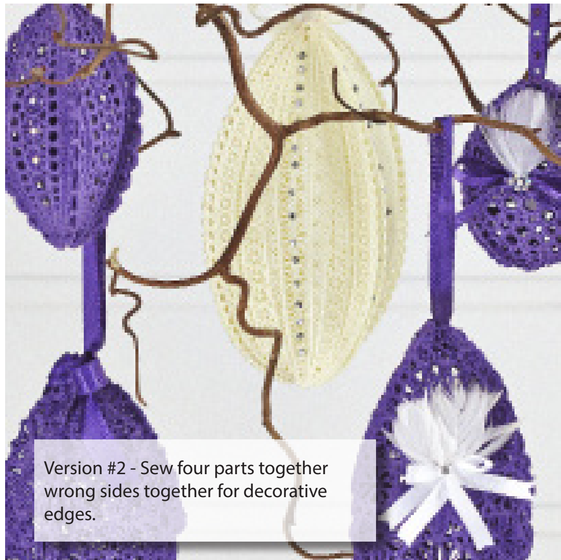
Version #2 - Sew four parts together wrong sides together for decorative edges.